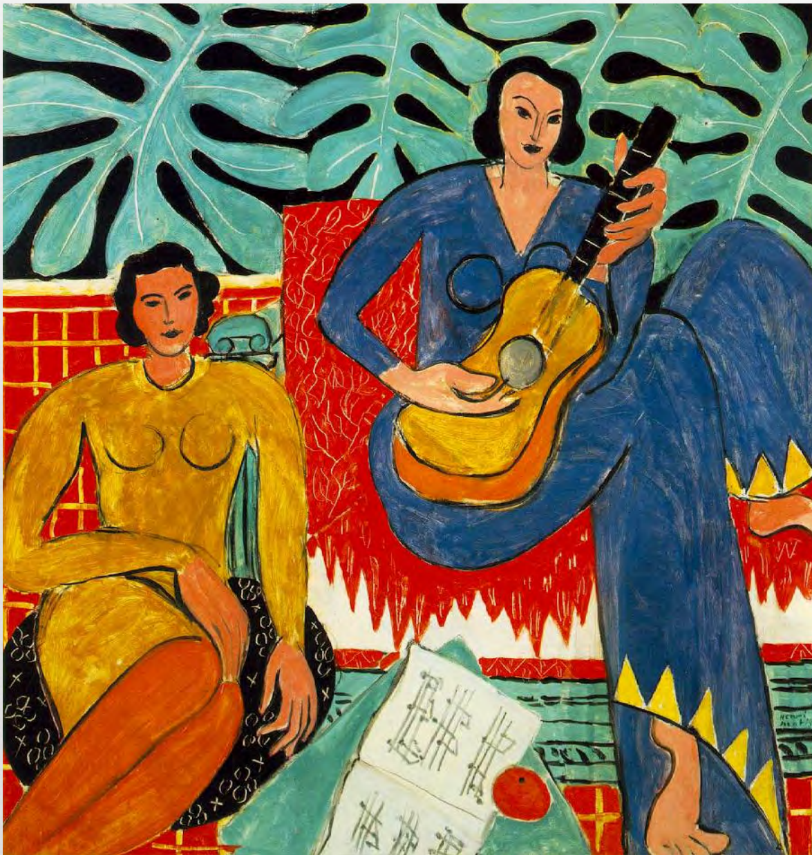
La Musique Henri Matisse 1939 Oil on canvas