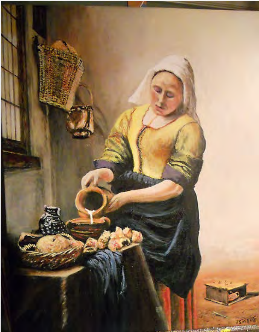
Maid Pouring Cream Johannes Vermeer 1670(?)