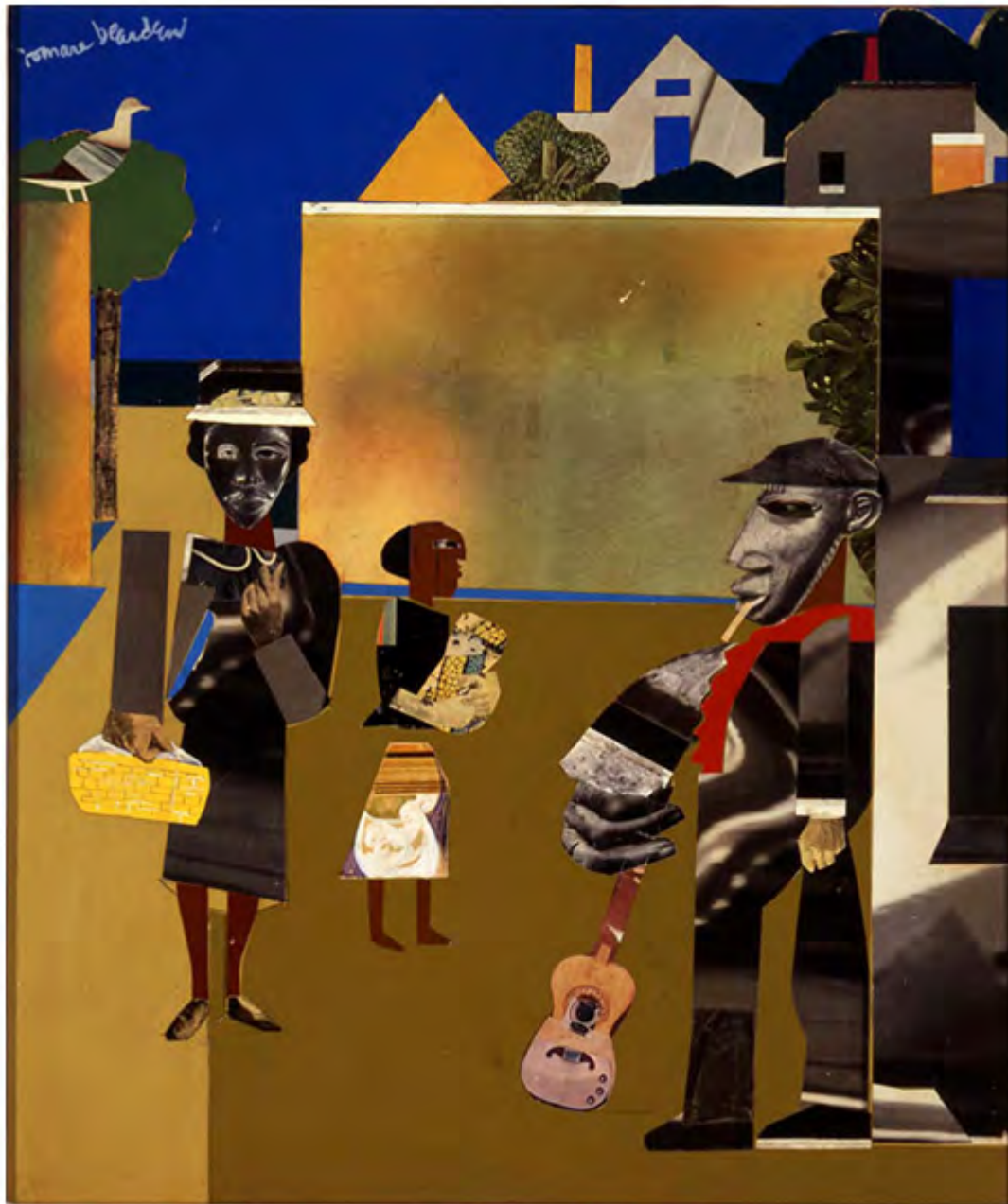
Village Square Romare Bearden 1969 Collage on paperboard