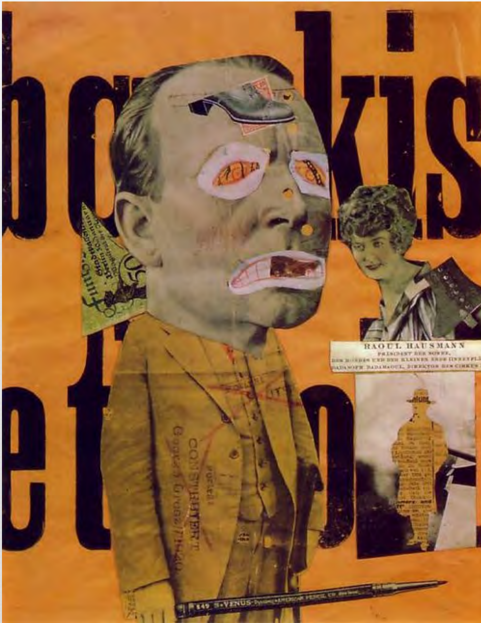
The Art Critic Raoul Hausmann, 1919