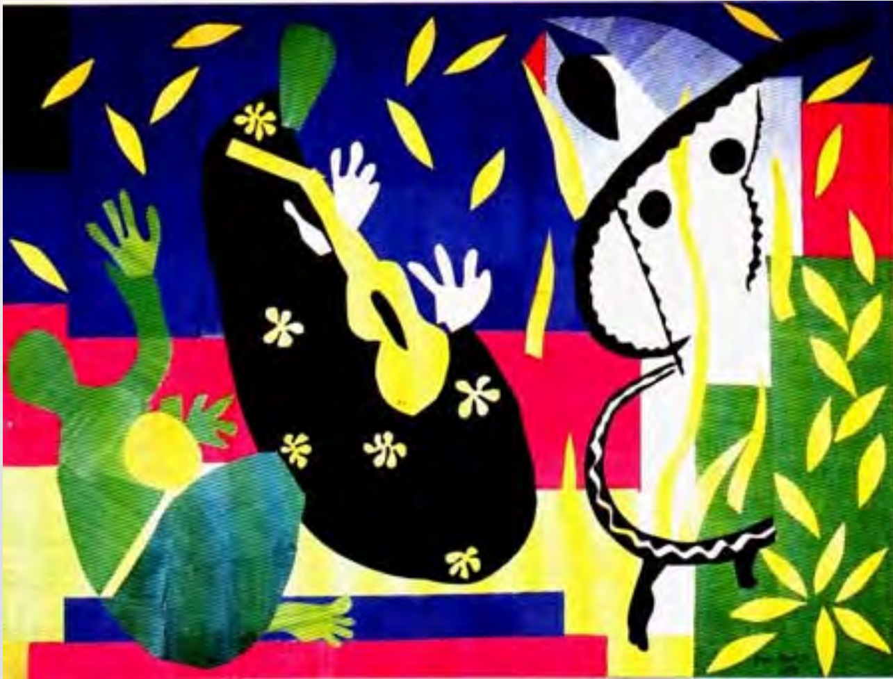
Sorrow of the King Henri Matisse 1952 Cut paper