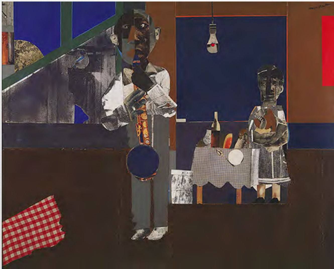
The Woodshed Romare Bearden 1969 Paper, fabric, and pencil collage