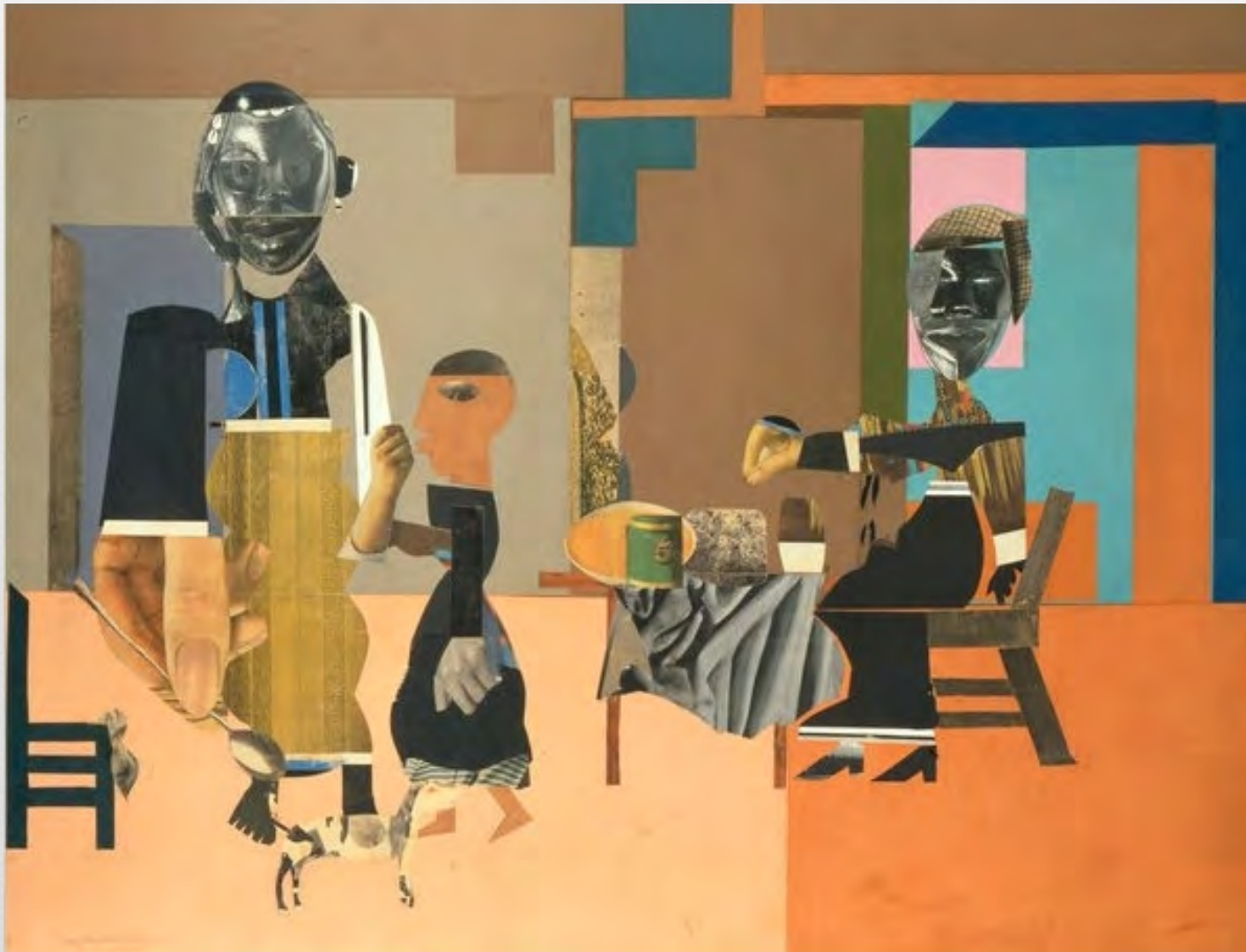
Illusionist at 4pm Romare Bearden 1967 Collage