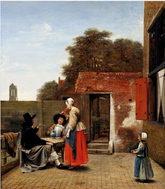
A Dutch Courtyard Pieter de Hooch 1658-1660 Oil on Canvas