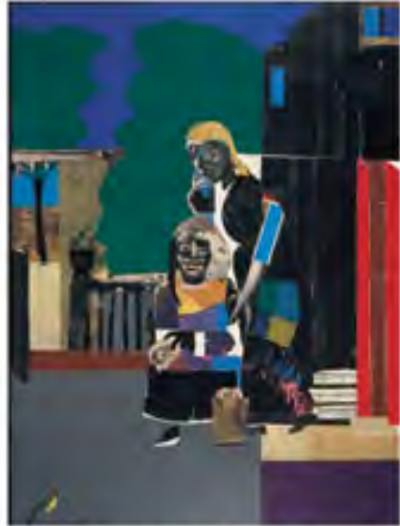
Romare Bearden, Backyard , 1967, collage of various papers with graphite on fiberboard. Marian B. Javits