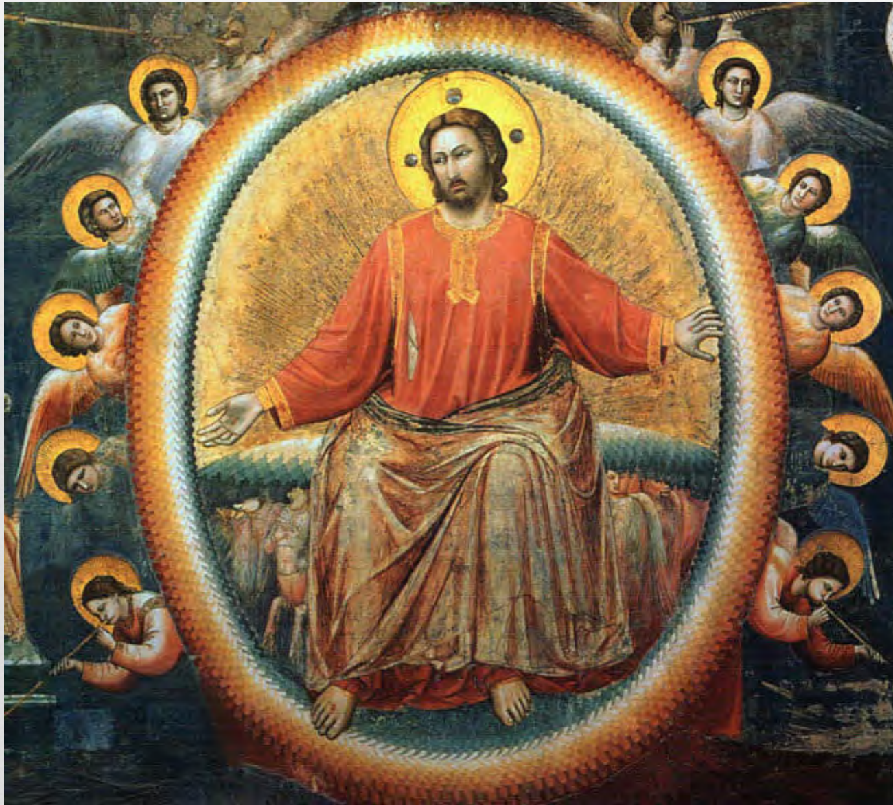
The Last Judgement Giotto 1303-1305